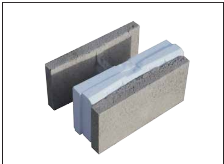
The Two-Piece CBIS Korfil Hi-R H inserts form a lap joint with adjacent inserts, both above and below and from side to side, for maximum insulation efficiency.

Please visit www.concreteproductsgroup.com for design and construction resources including CAD details, design and construction videos and structural design guidance