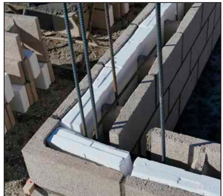
Insulated corners are built using conventional masonry fittings and Hi-R H units