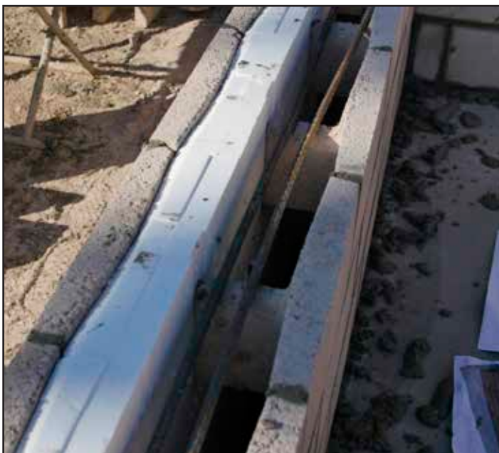
Hi-R H units are suitable for construction of bond beams without the need for any modifications to the units and the insulation inserts remain fully in place

Availability Note: 10" Hi-R H units are manufactured only in certain regions. Please check with your local CPG member regarding availability of that unit in your region. 12" units are generally available.